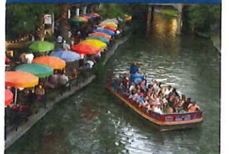
Relax on a cruise at the famous River Walk