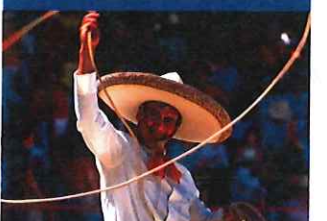
Enjoy the sights and sounds of San Antonio