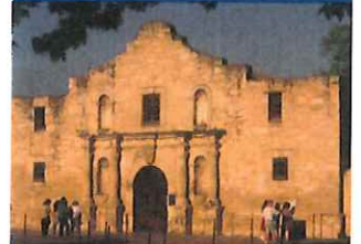
Stand where history took place at the Alamo